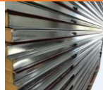
wall panel side with metal covered